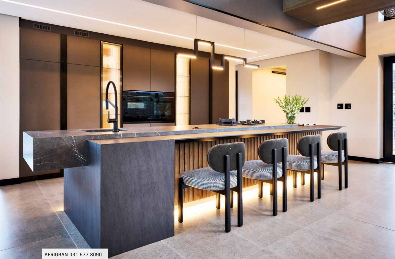
AFRIGRAN 031 577 8090

ABOVE: Afrigran was responsible for the countertop and décor stonework featured in this home. The Afrigran stonework comprised a combination of quartz and sintered porcelain (like ABK stone). The careful combination of these products produces a wonderful visual experience. High-end robotic templating (a unique technology in South Africa) allows for exact precision workmanship. This system is transferred to CNC cutting at factory level. The end result is a perfect product with precise mitres and therefore a faultless finish. Integrated stone basins form part of the countertop aesthetics.