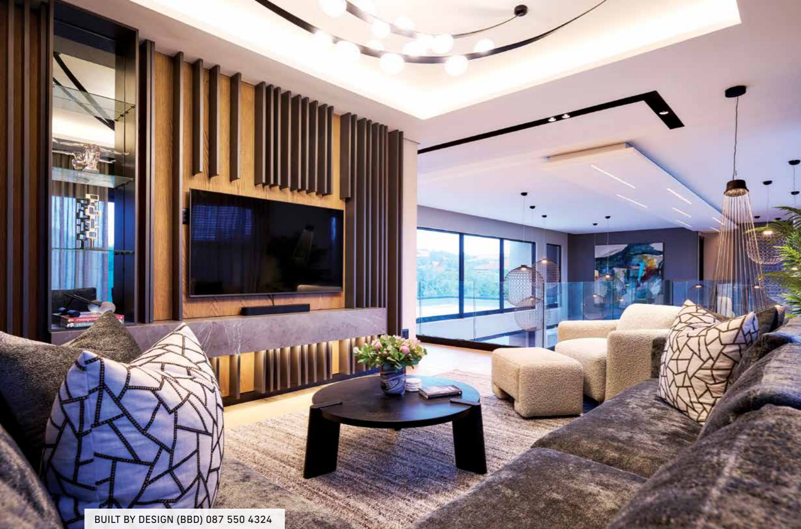
BUILT BY DESIGN (BBD) 087 550 4324